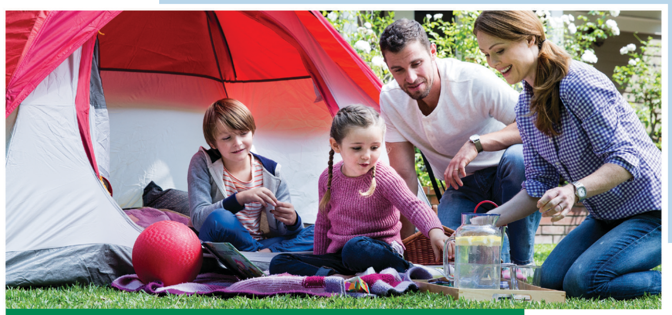
HOW TO FILE A CLAIM OR REQUEST A LEAVE